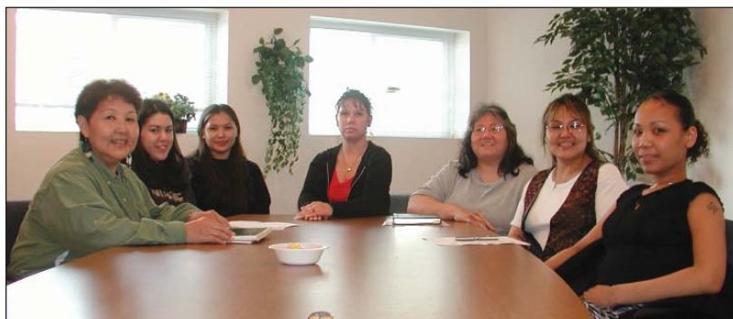
HTCI students participate in training and education which prepares individuals for employment and assists with job placement in the tourism industry. Pictured to the left is a recent class.