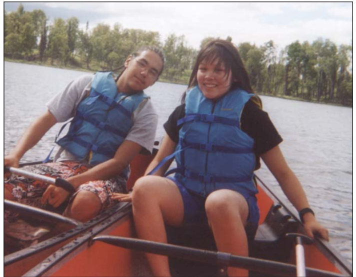
Participants in the 2003 Camp enjoy canoeing

Cook Inlet Tribal Council's 6th Annual Summer Cultural Enrichment and Reforestation Camp at Ninilchik is taking applications now for the summer 2004 season for youth ages 14 to 18 years of age. There will be five 10-day sessions starting June 14 and ending August 18. The camp is located near Ninilchik. The camp participants engage in a variety of activities, such as work ethics and life skill classes, service learning, and traditional Alaska Native cultural activities. There is no charge to the participants. Stipends are paid for satisfactory performance and participants have a chance to earn half elective school credit. Applications can be obtained online at www.citci.com , or by calling Courtney Sullivan at (907) 279-1772 in Anchorage or toll-free at 1(877) 985-5900. 🏞️