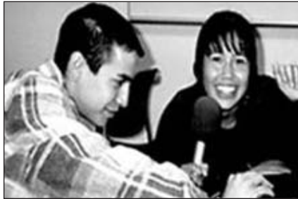
MEDIAK will bring media curriculum to four Anchorage high schools

CITC, in partnership with Koahnic Broadcast Corporation (KBC), has received funding from the Department of Education to bring media curriculum and activities to the four Anchorage high schools in CITC's Partners for Success program. The new program, MEDIAK, is short for the Media Educational Development Institute of Alaska. MEDIAK draws upon the strengths of both CITC's Educational Services System and KBC, an established leader in bringing Native voices to Alaska and the nation.