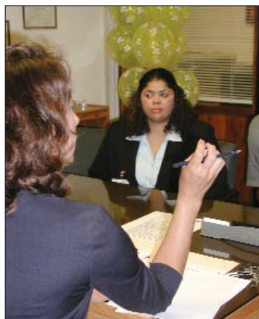
The first IDA participant opens an account at Wells Fargo

The IDA participants will be able to successfully obtain an asset such as a first home, open a small business or pay for a post-secondary education. The program provides the incentive of matching savings dollars. A participant in the program can save a maximum of $800 and receive a matching contribution from CITC of $4000.