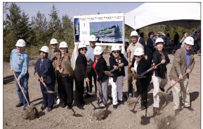
CITC board members break ground at the site for the new building.

volumes about who we are and what we value. This building will demonstrate to our community, and to the entire state of Alaska, that Cook Inlet Tribal Council is an indispensable part of the regional landscape. Instead of our programs being scattered around Anchorage, as they currently are, they will be centralized in an easily accessible, modern and efficient facility.