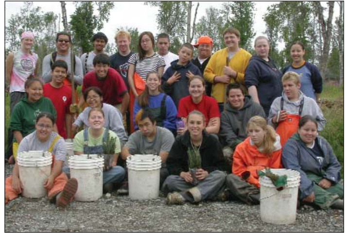
Campers made 1,200 feet of ATV trails and planted 25,000 spruce tree seedlings at the 2004 camp.

The Cultural Enrichment and Reforestation Camp in