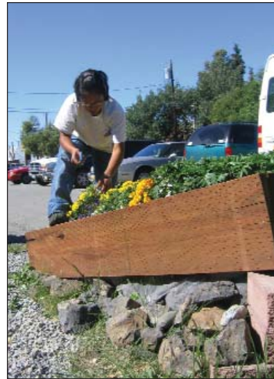
Students cared for more than 50 varieties of vegetables and flowers.

Visiting guests interested in the Greenhouse Project gave students a chance to practice important skills such as making introductions, shaking hands and public speaking. This summer's visitors included the CITC Board of Directors and Senator Murkowski's Health and Human services staff member.