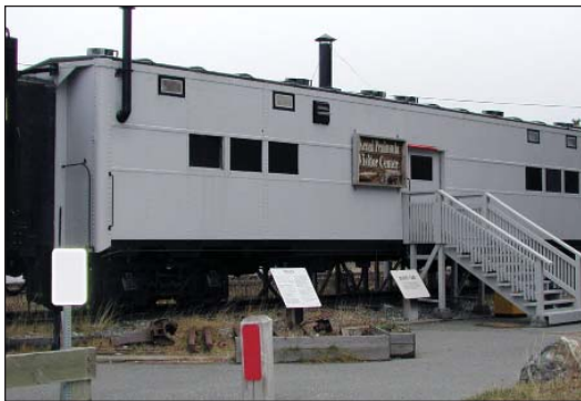
Participants learn valuable skills while working at the railroad car.

Located across from Potter Marsh at a scenic vista, the CITC Railroad Car sells arts and crafts produced by Alaska Native residents in the Ernie Turner Center work therapy program. Under the direction of a master craftsman, participants with diverse talents produce both traditional and original works of art, such as earrings, soapstone carvings and postcards. Gifts are available at a wide range of