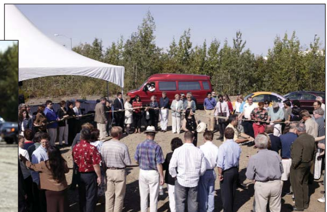
Members of the community gathered for a cloth ceremony at the site of the new Nonprofit Services Center.